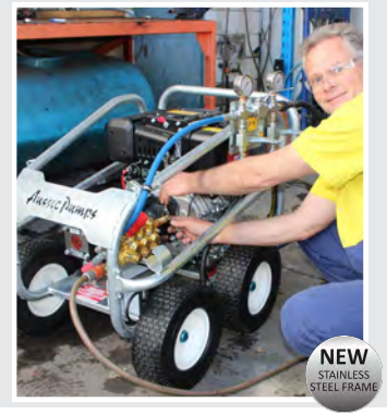
Australian Pump reserves the right