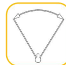
Part circle and Full circle