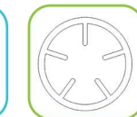
Barrel cross section